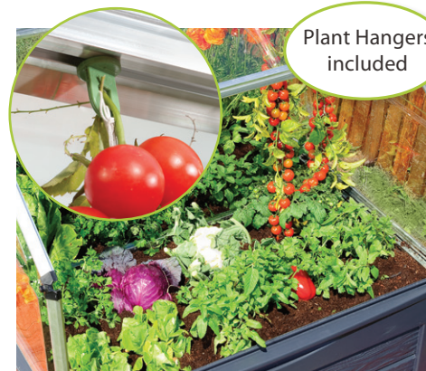
Plant Hangers included

For ventilation - temperature and humidity balancing