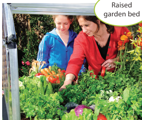
Raised garden bed