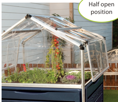
Half open position

For ventilation - temperature and humidity balancing