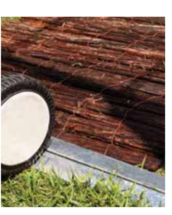
Wheelbarrow threshold ramp

Roof panels - Twin-Wall Polycarbonate protects from strong sunlight exposure at noon