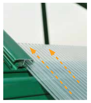
Sliding panel assembly system