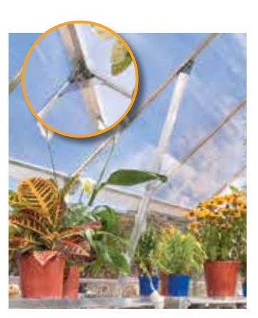
2 vent windows included